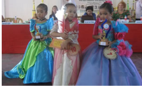
Best Muse and Best Costume