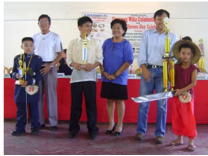
Best in National costume for Elementary Boys Division