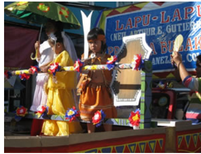
2nd place for Best Float Pre-school Division