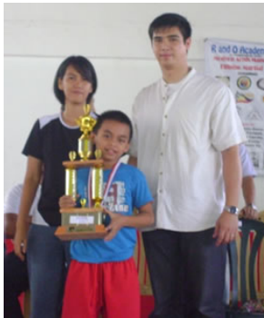
Champion in Anyo competition Elementary Boys Division