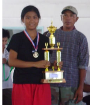
High School Boys Division Arnīs Sparring Champion from Isabela Arnīs Club