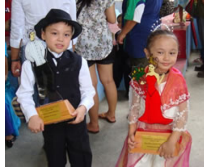
Best Muse and Best Escort