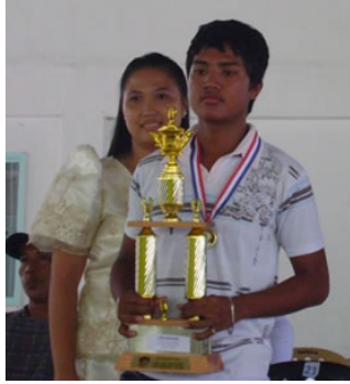
Arnīs Sparring Champion for the High School Boys Division