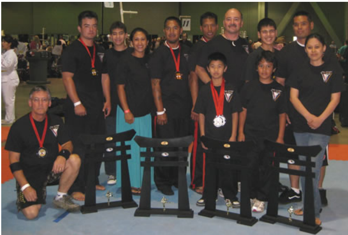
South Bay Filipino Martial Arts Club