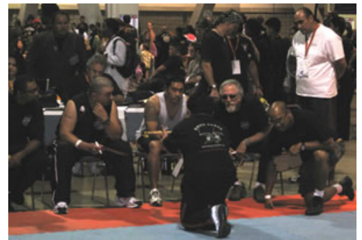
USFMAF and WEKAF conferring on forms competition

Filipino martial arts once again had very large showing, with nine divisions of competition and fighters in every one of them. Athletes had the ability to try out just about any Filipino martial arts weapon divisions that could be offered. Comradery was well spread in this tournament whether competitor, volunteer or spectator. WEKAF and USFMAF judges joined together in the forms divisions.