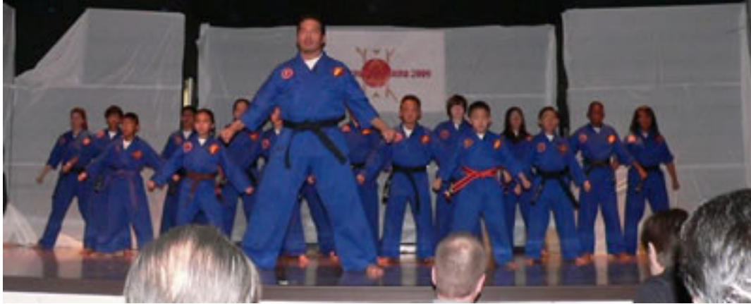
Castro Valley - Demo Team