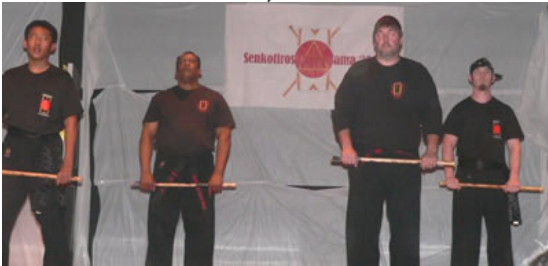
Senkotiros - Texas