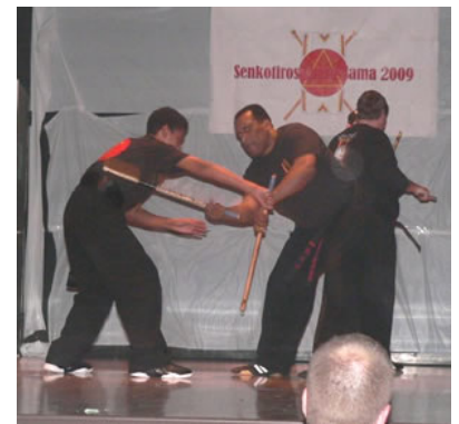
Senkotiros - Texas