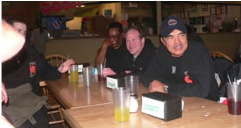
A get together for Dinner after the seminar