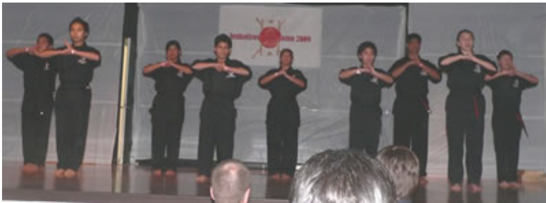
Union City - Demo Team