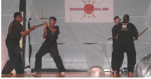
Senkotiros - Texas