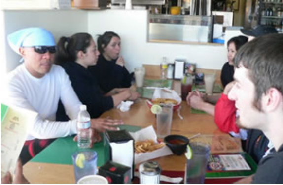
Lunch to gather the strength