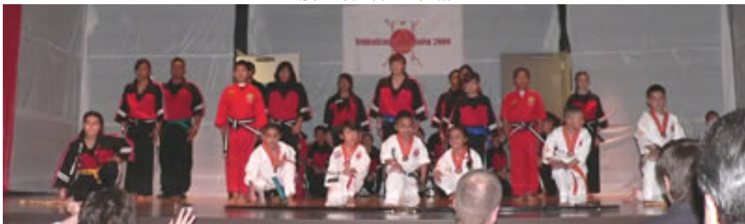
San Leandro - Demo Team