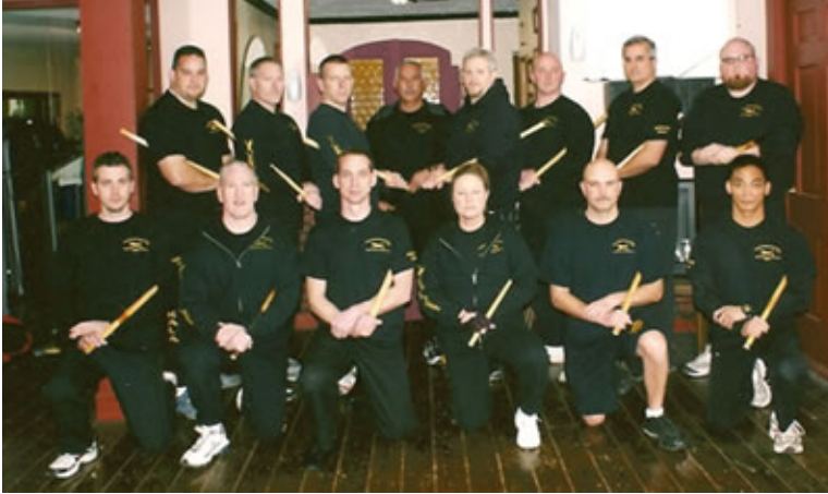
Isang Mundo Isang Tribo Academy of Serrada Escrima and Tanikala De Mano Instructors

cognizant that becoming a trainer is just the beginning of their journey. The ultimate challenge will be what they have learned from their experiences in the field and from their students, so they as instructors may present it in an instructional platform.