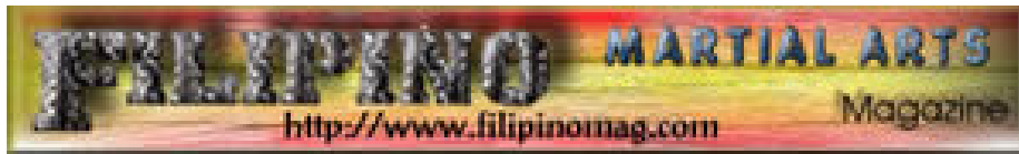
Filipino Martial Arts Magazine