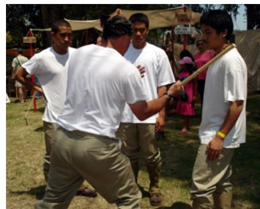
Targeting with stick

have to show what they know and then promote via sparring that level and higher. Here is a summary of these levels. Again it is only a summary and there is more in the training outline found on the South Bay Filipino Martial Art club's website.