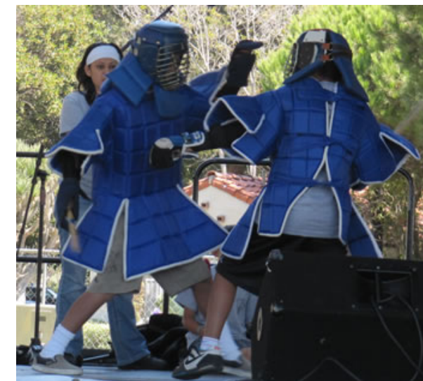
Full Contact Sparring

In Level-8 - the students have learned to demonstrate the entire curriculum that is taught. They are able to lead group. They can perform healing methods. They have learned a comprehensive understanding of the human body. They understand the use of internal and external energy development. They can coach a fighter, judge a tournament and plan a seminar. They can demonstrate proficiency with whatever weapon handed to them against multiple skilled opponents and more.