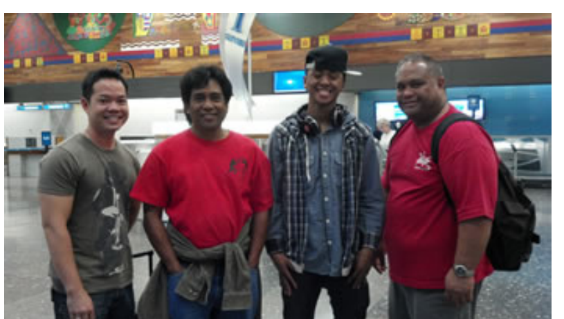
BDPH leving to compete in the Nationals

and all of our team. Seeing the Filipino martial arts being perpetuated and celebrated by people from many backgrounds at all age levels made me proud to be part of the rich cultural traditions of the Philippines.