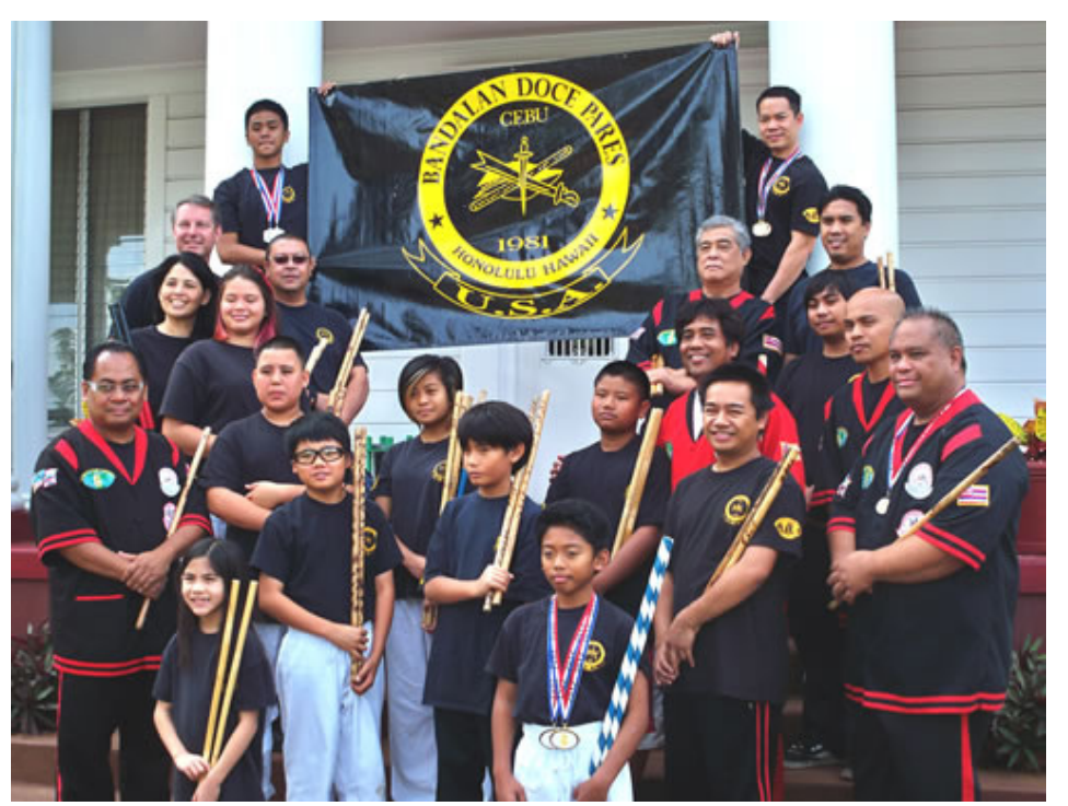
Bandalan Doce Pares Hawaii