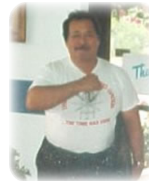
Grandmaster Baltazar Sayoc