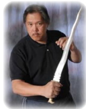
Grandmaster Rene Latosa