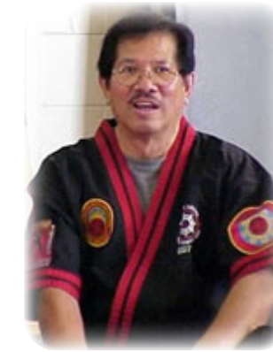
Grandmaster Remy Presas