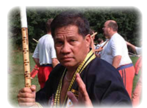
Grandmaster Ernesto Presas