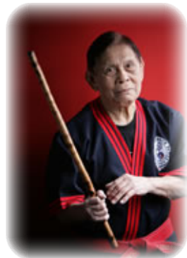
Great Grandmaster Cacoy Canete