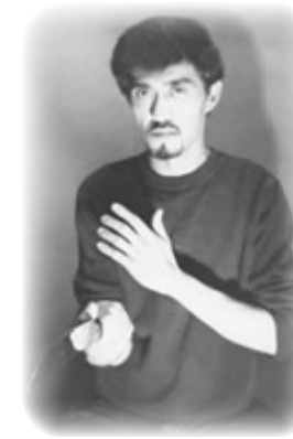
Grandmaster Sonny Umpad