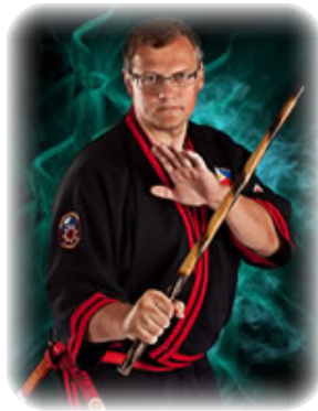
Grandmaster Dieter Knuttel