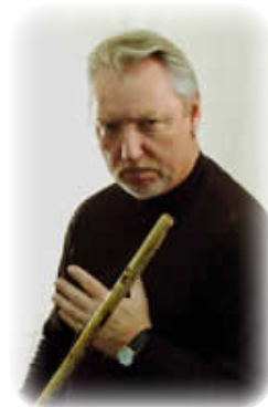
Grandmaster Kelly Worden