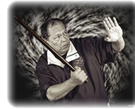
Grandmaster Bobby Taboada