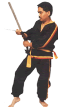
Grandmaster Arnulfo Cuesta