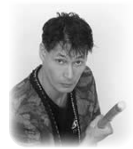
Grandmaster Jimmy Tacosa