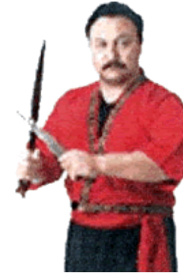
Grandmaster Vincent Cabaless