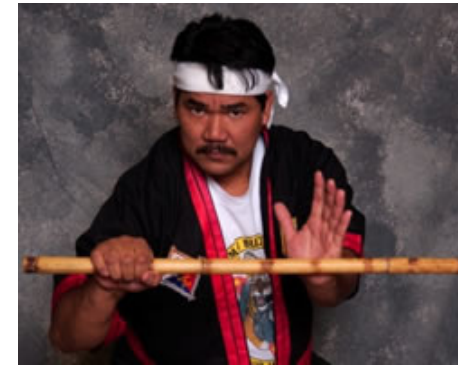
GAT Puno Abon Baet