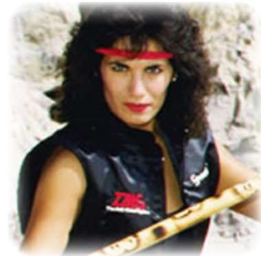
Grandmaster Gracilia Casillas