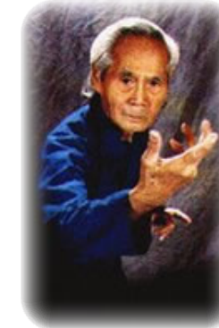
Grandmaster Florendo Visitacion