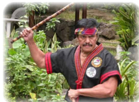
Grandmaster Roland Dantes