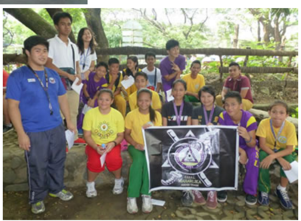
Students from Concepcion Integrated High School. Some of them also won medals but what struck me most about this group is their courtesy and gratefulness. They smiled, greeted people, and said "thank you" many times. Look at those pleasant faces.