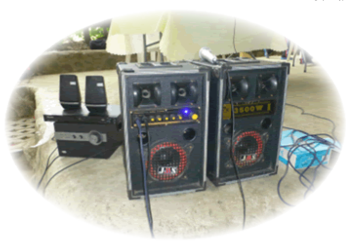
A sentimental photo of our old reliable public address system. We hope to upgrade soon.