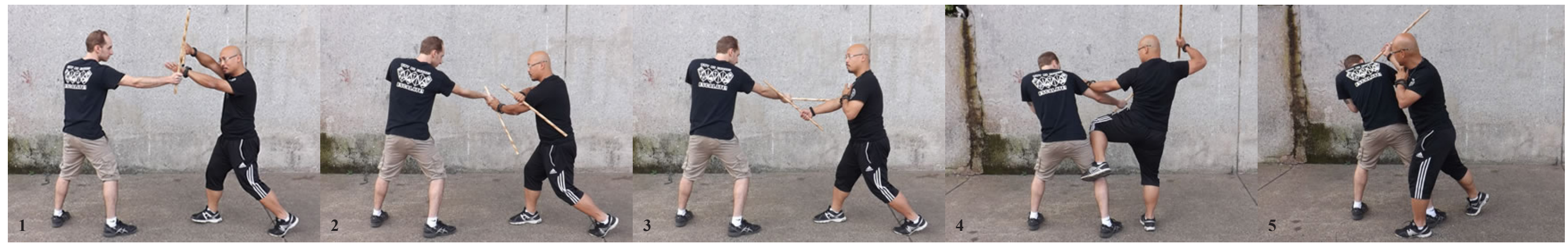
1. Use "payong" to block overhead strike but return stick to shoulder. 2. Guide and redirect weapon hand counter clockwise. 3. Enter into "banda y banda" to suppress weapon hand. 4. Shift to power stance with knee to opponents leg. 5. Counter attack with punyo at close range.