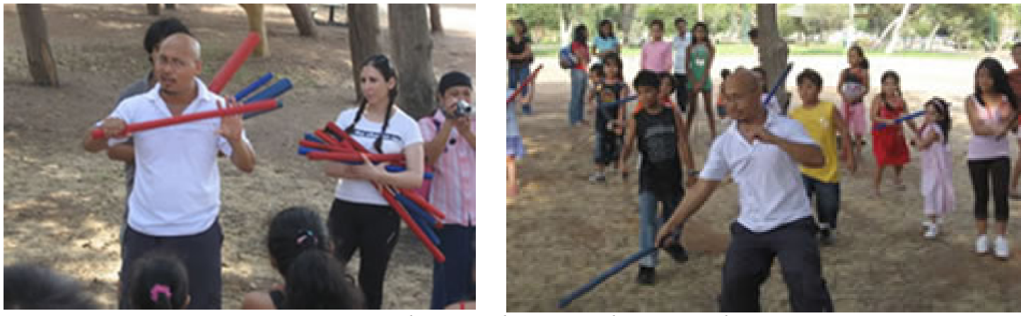
Bata-Batuta learning Filipino martial arts in Israel August 28, 2008

Master Escudero has found that in teaching in Israel there is a need to teach more of the fighting side of the art, ahead of the stylistic aspect of the art, to put it simply defense-attack, defend-counter